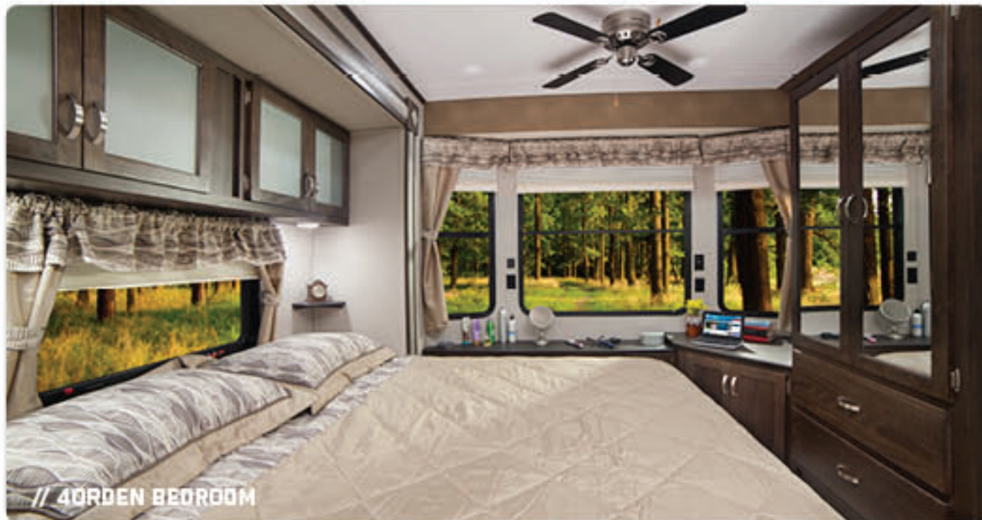
// 40RDEN BEDROOM