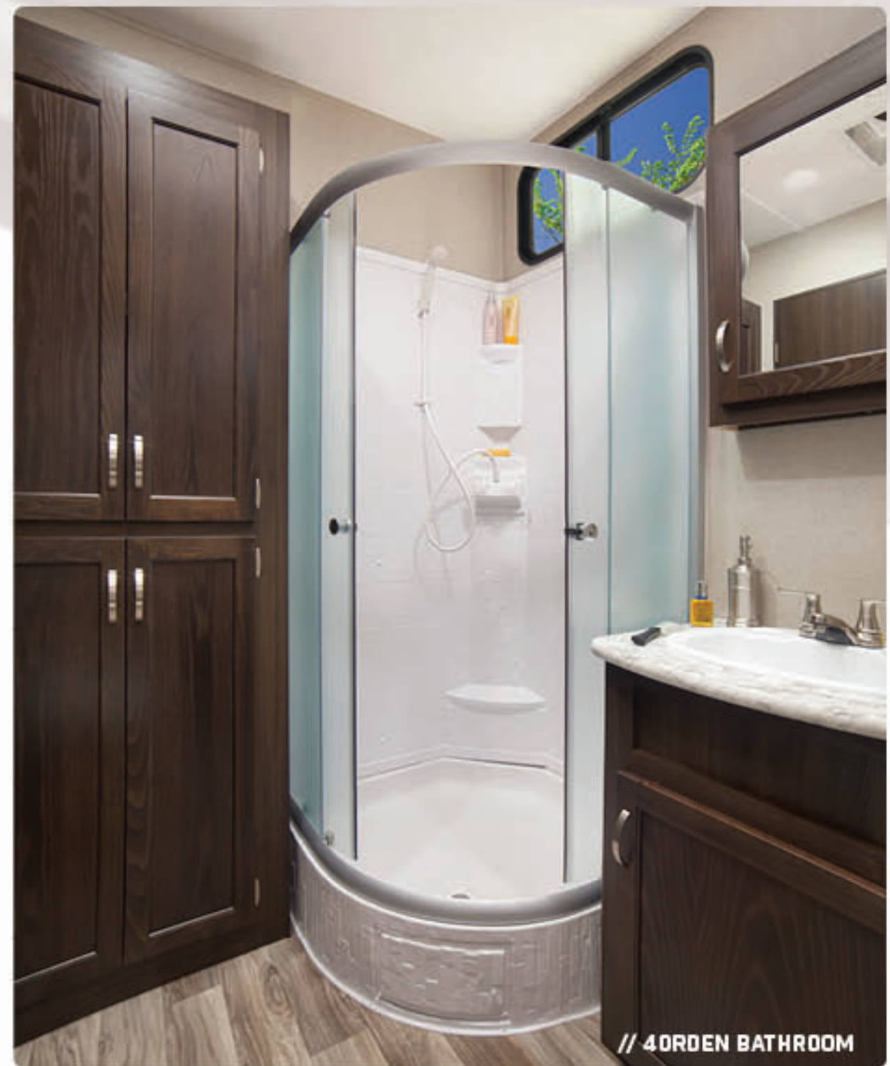
// 40RDEN BATHROOM