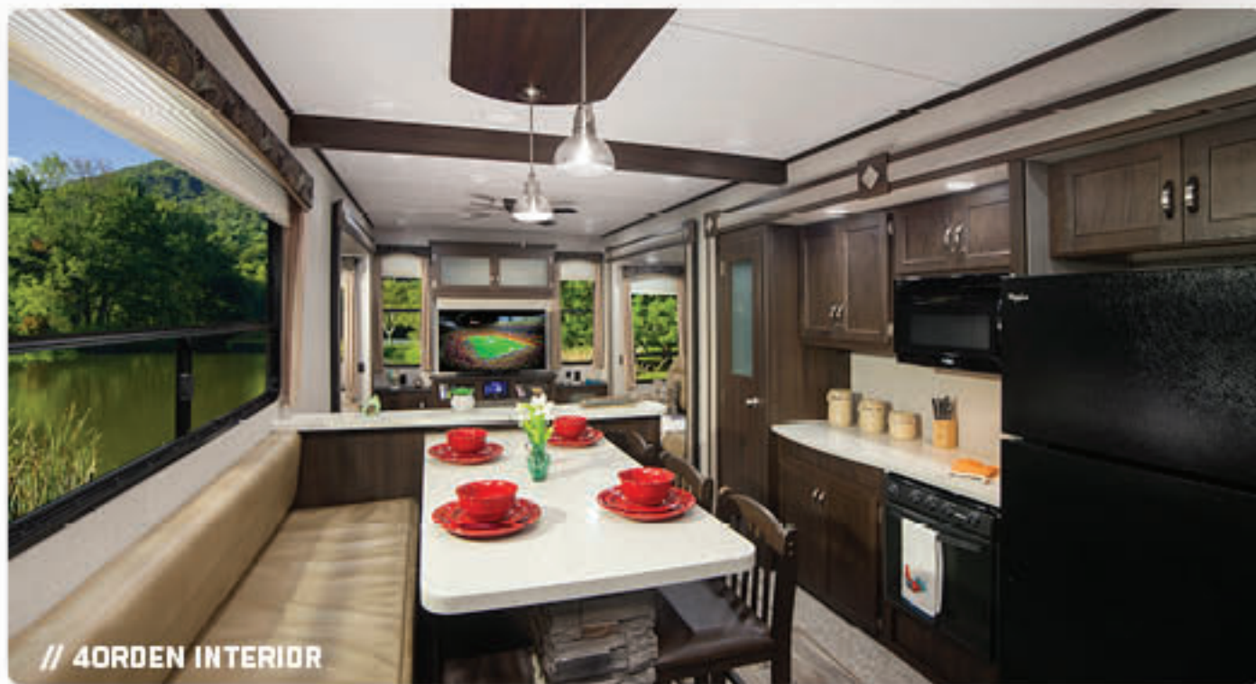
// 40RDEN INTERIOR