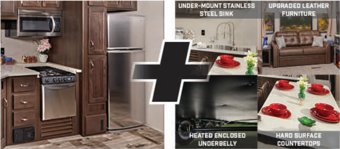
STAINLESS STEEL APPLIANCES